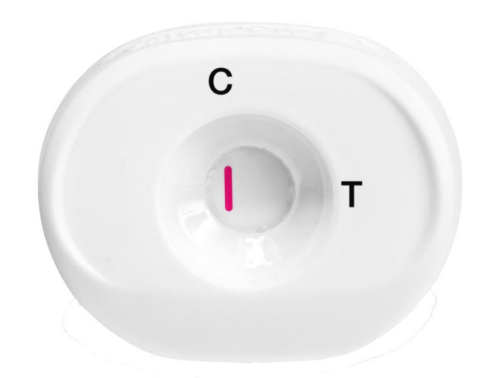
Total Antibody Positive Result shown above